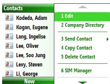
Easy-to-use Contacts List