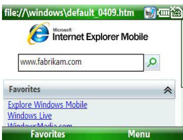
Windows Mobile 6 with Internet Explorer Mobile and Windows Live