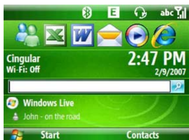
Enhanced Home Screen