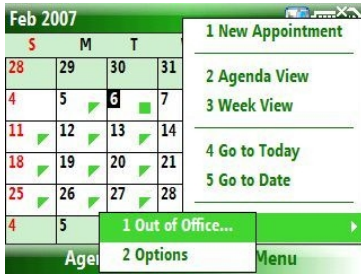
Enhanced calendar functions including out-of-office assistant