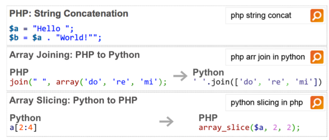
Figure 6. Code tutorial answers. Within a domain, Tail Answers like these can specialize their user interface.

To extract content from web pages and turn that content into an answer, we used paid crowdsourcing. As