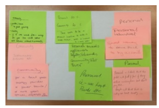
Figure 2. Use of financial savings from energy saving activities: personal vs communal goals.

for more formal support mechanisms within P2P markets. We suggested that structures are put in place to support vulnerable populations in participating and benefiting from P2P energy markets; this includes proving opportunities for staged engagement and continuous education , energy trading as a service, and group-led policies for charitable donations.