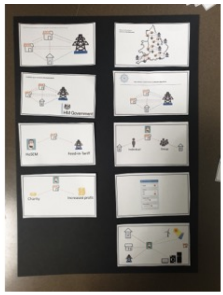
Figure 1. Sample vignette and sketch desings.

carbonization process and the ways they talked about a P2P electricity-trading platform. We chose these categories based on our primary research interests. We then followed the six steps of thematic analysis to develop five inductive themes.