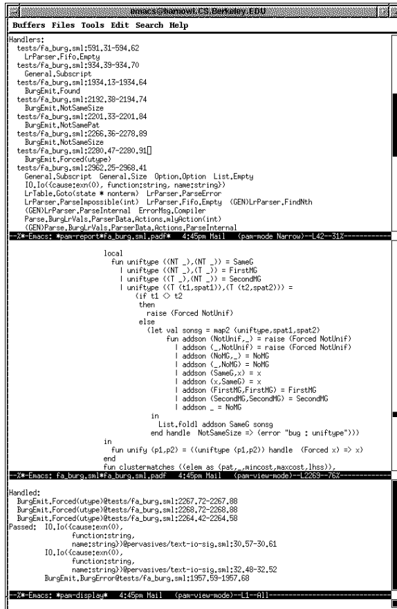
Figure 1: Screen shot of PAM viewing ML-BURG

Figure 1 shows a screen shot of PAM viewing the analysis result of ML-BURG. The top window shows the report section, focused on the list of handle expressions. The middle window shows the source text as it would be displayed when clicking on the second to last handler in the report section (cursor position). The handler in question appears near the bottom of the middle window, handling Forced . The bottom window shows the result of clicking on the handle keyword of the handler in the middle window. This display shows that the handled Forced exception is raised at three positions (also visible in the middle window). Two Io exceptions and the BurgError exception (raised by the call to error visible in the middle window) fall through the handler.