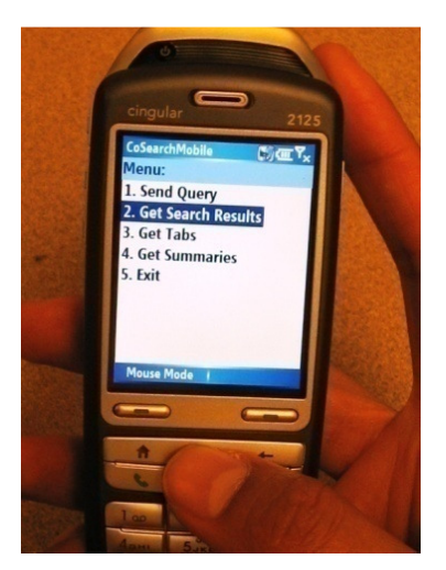
Figure 2. CoSearchMobile (main menu).

stored on most phones. Each group member would still have her own cursor on the PC, controlled by her phone. By selecting "Mouse Mode" from the CoSearchMobile main menu, users can move the PC's cursors via the phone's joystick or keypad, thus mimicking all the functionality provided by multiple mice in the basic usage scenario.