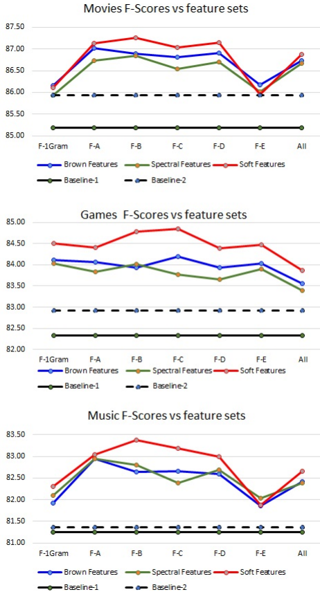
Figure 2: Slot tagging performance for (top) Movies, (middle) Games, and (bottom) Music domain test sets for different feature sets . Each line on each chart indicates the average model F-scores of features with different cluster sizes when ( \sim ) Baseline-1 with unigram features, (dotted- \sim ) Baseline-2 with unigram+bigram features, ( \sim ) Brown, ( \sim ) Spectral, and ( \sim ) Soft clustering are used.