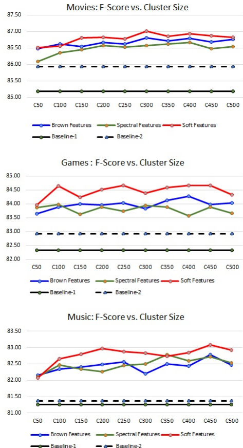
Figure 1: Slot tagging performance for (top) Movies, (middle) Games, and (bottom) Music domain test sets for different cluster sizes of clustering features. Each line on each chart indicates the average model F-scores of the feature sets when (—) Baseline-1 with unigram features, (---) Baseline-2 with unigram+bigram features, (—) Brown, (—) Spectral, and (—) Soft clustering are used.

Here, we investigate whether the cluster size and clustering methods has effect on the model performance. Fig. 1 shows the results where we build separate CRF models using Brown, Spectral and soft clustering (Brown+spectral) with the defined