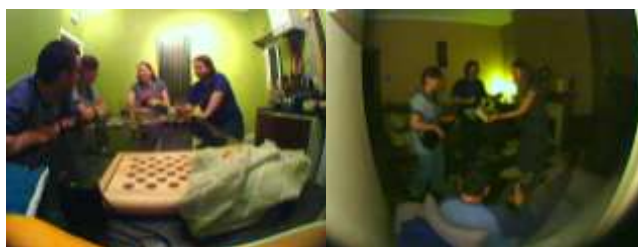
Figure 4. Images captured from SenseCams during an evening of game-play.

Wearing a SenseCam also seemed to provoke a degree of creativity in these participants, which might not normally have been expressed. The woman who was quoted above describing her walk not only positioned her SenseCam in unusual places, such as hanging from trees, but also chose to deliberately take pictures, featuring subjects that she would not usually capture: