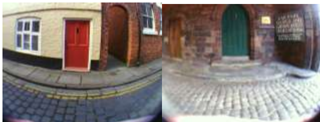
Figure 5. Images deliberately captured of doorways in Chester.

camera round my neck, and cos it was there I used it ... that's an arty thing that I wouldn't normally have gone out and done.