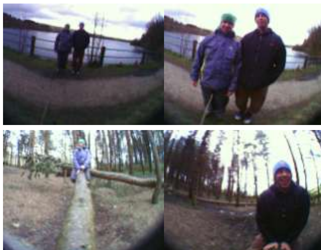
Figure 3. Images captured from a SenseCam hanging from a tree and while on a seesaw.

The two couples also arranged to meet up during the week. This was partly encouraged by their participation in the field trial; we had suggested to all householders that they might use their SenseCams to gain multiple different perspectives during some kind of event. Interestingly though, the couples were the only participants to follow this up. They organised an evening in which they played board games and also computer games such as Guitar Hero, and positioned SenseCams around the room to capture different views (Fig. 4). In these cases, the overriding impression was one of playfulness and, by their own admission, the evening became progressively more chaotic, fuelled by the consumption of alcohol.