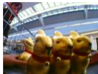
Figure 7. Image of Easter rabbits taken by a grandson's SenseCam at a supermarket.