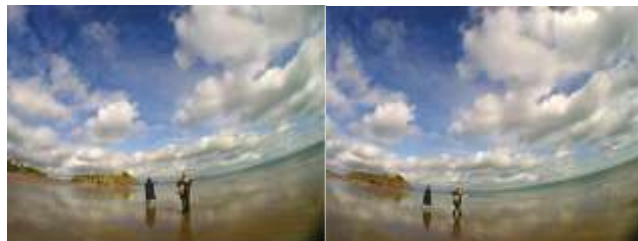
Figure 6. Images taken on a family walk.

Granddad: and, you know, when you're sitting around telling a story, you know, 'do you remember when...', and you could just get it out ... the laptop.