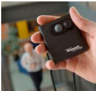
Figure 1. The SenseCam device used in this study

displaying images back to the user; these must instead be downloaded onto a computer. Images that are imported together are saved in a specially created folder, and can be opened directly or viewed using a dedicated piece of software. This allows photos to be played back at varying speeds, and enables the viewer to bookmark and label sequences of interest.