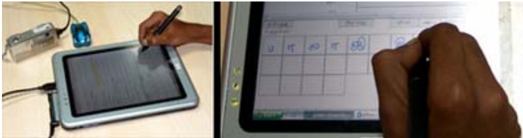
Figure 1: the tablet PC setup and interface

We ran the usability study on an Indic script pen-based interface implemented on a tablet PC with 16 participants. The recognizer was implemented on a HP tablet PC using Microsoft windows for pen software environment as shown in Figure 1. The recognizer was set to operate in a boxed entry mode, which required the users to write discrete characters in separate boxes. The users were asked to write around 140 Tamil characters in the first round and then the system was adapted to each one of the participants. After this stage participants were asked to perform the tasks in random order so as to negate order effect within the subjects.