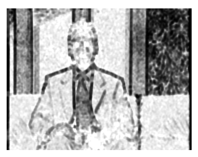
Figure 4 - Attenuation map ( whiter = attenuate more )

Figures 2-8 illustrate some of the results obtained by applying the algorithm. Figure 2 is the original frame 50 of the MPEG-4 test sequence SEAN, while Figure 3 represents the high frequency content in that same frame. Figure 4 shows the attenuation map, which highlights regions where the high frequency content was not tracked by the MC, and should therefore be attenuated. Note that all textured regions of the background (e.g. the plants and the textured columns) appear dark in 4, meaning they will have their detail information preserved. The same is true of regions that are well tracked by the MC, like the dark suit contour, or the tie. In contrast, flat regions of the background (where high frequencies are dominated by camera noise) will be low-passed, like the sofa or the wall. Similarly, regions that have complex motion (e.g., face,