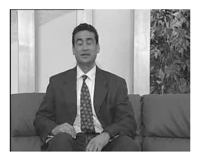
Figure 7 – Encoded Frame without pre-processing.