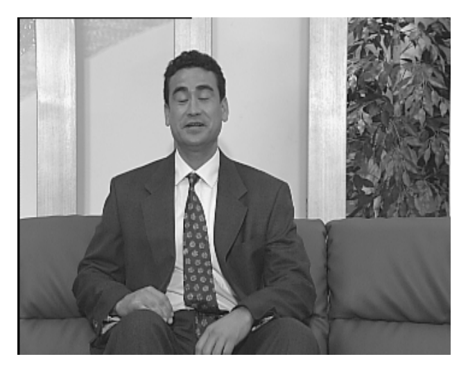
Figure 2 – Original frame