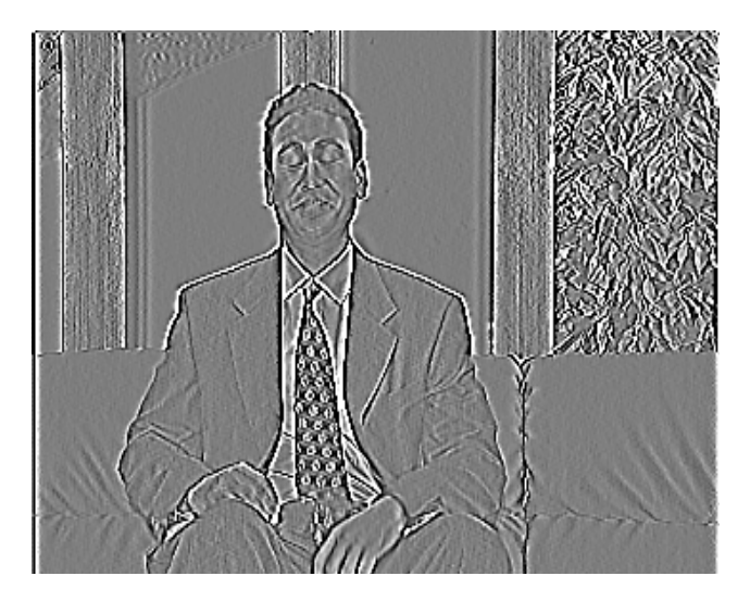
Figure 5 - High frequency content of processed frame

hands) will have the high frequency detail removed, making it easier for the encoder to allocate bits to the relevant information. This attenuation of the undesired high frequencies can be observed by comparing Figures 3 and 5, which shows the high frequency content of the output (processed) frame. The main effect of the proposed algorithm is to reinforce video elements that can be tracked by the eye, and therefore the difference is mostly noticeable in watching video. Figure 6 compares the coding error in terms of SNR. Note that even though the desired result of the proposed technique is mostly to improve subjective quality by improving quality of trackable content, it even improves the SNR marginally by around 0.2dB. Figures 7 and 8 show the same frame after coding.