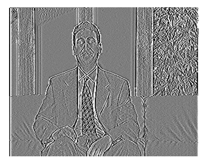
Figure 3 - High Frequency content of original frame