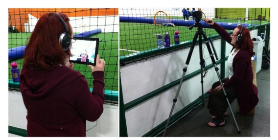
Figure 11. Indoor soccer practice with remote Dad.

For Group 8, the mother took her daughter (age 6) to her indoor soccer practice, while the father connected from his office. The mother used a headset to hear over the noise in the arena. They first used the E2G prototype followed by the iPad. The arrangement of the slate on the tripod made it difficult for the mother to sit, control the camera, and be face to face with her husband. Nevertheless, she felt that it was simply "kind of a new thing that you've gotta get used to following someone around." During a water break, the daughter came over to her mother and her mother tried to get the daughter to say hello to her father.