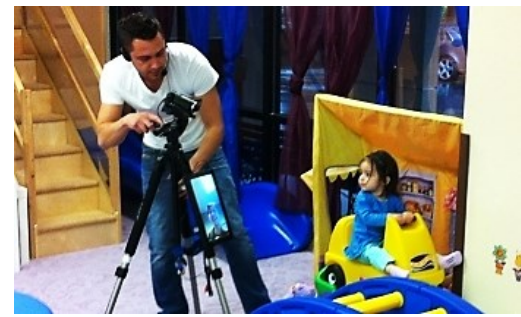
Figure 1. Mom remotely watches her daughter play together with Dad through the Experiences2Go prototype.

We studied the use of two systems for sharing experiences: 1) an iPad running Skype and 2) an Experiences2Go (E2G) prototype we built, consisting of a networked slate and