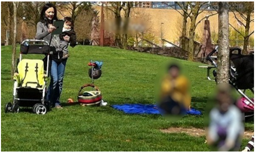
Figure 5. Playing in the park with remote Dad.

The Group 2 session involved free play in a public park on a sunny day. The mother attended with her two children (ages 18 months and 3 years) while the father worked from home. Because of the loud noise of lawnmowers in the park, the mother had to use headphones. Due to technical problems she was unable to try the E2G prototype.