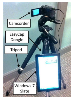
Figure 3. The E2G prototype enables a remote person to attend an event while also socializing with others at the event.

Skype was used for the audio and video connection. A Verizon 4G hotspot provided internet connectivity. Thus, our E2G prototype was completely wireless with approximately 100 minutes of battery life, allowing portable use almost anywhere.