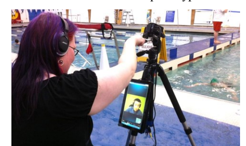
Figure 7. Swimming lesson with remote friend watching.

In Group 4, a mother took her two sons (ages 8 and 13) to their swim lessons while a family friend (Jenny) connected from home via a laptop. Due to the noise in the pool area, the mother used a headset to hear Jenny better. She used the iPad first and then switched to the E2G prototype.