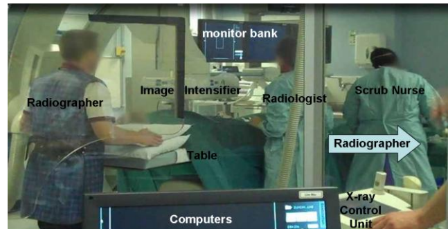
Figure 2: View towards x-ray table from computer area.

undertaken, details of interactions with particular equipment, interpretations of images, and explanations of talk and actions. In two of the procedures where only one radiologist performed the intervention, the second radiologist provided us an ongoing commentary that explained the actions and material arrangements being observed during the procedure. At breaks before or during the procedures we undertook longer in-depth interviews with team members to further clarify our interpretation and the reasons for particular behaviours.