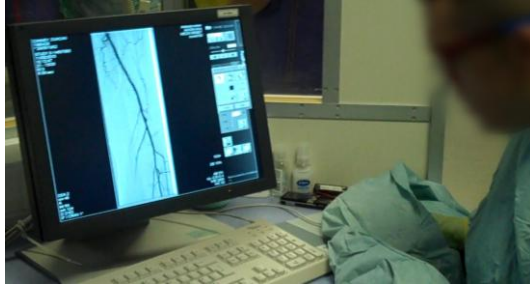
Figure 3: Radiologist using the mouse through his gown.

non-sterile. The cloth of the gown, then, is the boundary between these two conditions. With their sterile gloved hands, the radiologist grabs the sterile front of the gown, carefully hoisting it up and flipping it over their gloved hands. As seen in Figure 3, the non-sterile part of the gown is used to touch the mouse to manipulate and inspect the images. The infection control nurses we spoke with expressed concern about these workarounds, however they conceded it was the best available solution given that the radiologists needed to directly control the computer during the procedure.