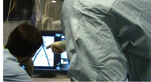
Figure 4: Radiologists gesturing over the angiographic runs.

over and point to particular features (see Figure 4), collaboratively interpreting the images and discuss the next steps in the intervention. This gesturing makes deictic reference to particular parts of the image as well as acting out more dynamic actions relating to current flow, suggested interventions and flow consequences of these interventions [cf 1]. As they inspect, they lean into the screen to see finer detail. These activities are the radiologists' " socially organized ways of seeing and understanding " [11]. Their professional vision is actively and collaboratively constructed through these activities and depends upon their specialized knowledge of the pathology.