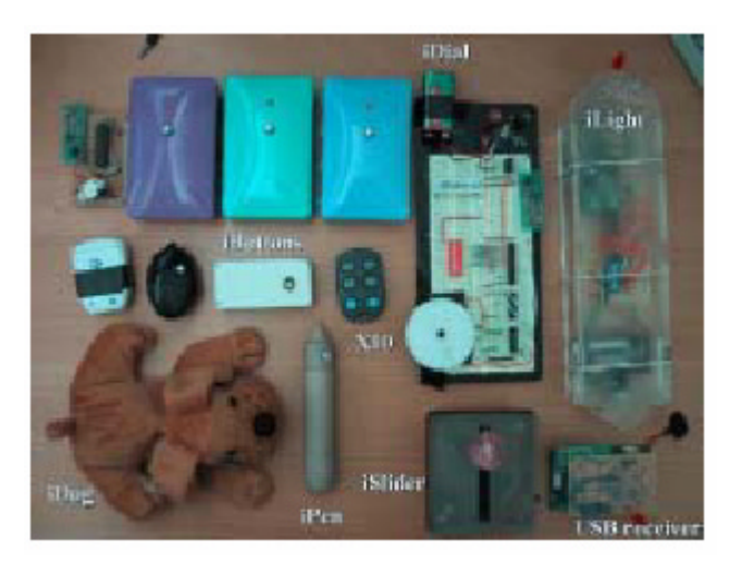
Figure 1 .Various iStuff. The iDog sends a button press event when turned over. The iPen is an augmented SMARTBoard pen, where the embedded button operates as a "right click" to the Windows OS. The X10 buttons are standard X10 hardware. All other devices work through a simple RF receiver that plugs into the USB port of the Proxy PC.

Utilizing the tuple-based event model of the Event Heap has allowed us to create configurable devices which are platform-independent. This architecture provides great flexibility and rapid prototyping of input devices [1]. It has allowed us to turn several commercially available items like X10 controllers into iStuff, in addition to our own custombuilt hardware. The "patch panel" software increases the flexibility of our toolkit by allowing for dynamically configuring mappings between events and devices, thus permitting exploration of the ramifications of having input devices that are not tied to a specific machine or display.