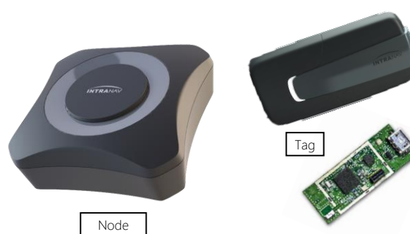
Figure 1. IntraNav nodes and tag - 2017

The deployed hardware consists of three components, the small, light weighted anchor nodes, (at least) one tag and a gateway which acts as a data collector and transmits the data to the backend; all devices were conceived by Quantitec. There are different type of Tags such as smart tags which do all the processing by themselves and deliver a position, or a simple tag which passes the data on to a device of your choosing for further processing as well as different sizes, interfaces and enclosures. The use of the different tags depends on the customer's wishes; either the smart tag for decentralized and autonomous systems or the simpler tag for mostly nonindustrial applications.