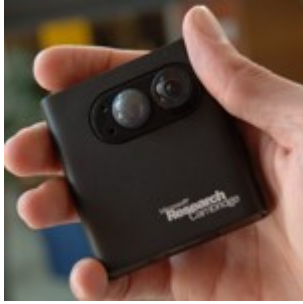
Figure 1: SenseCam

A purpose-built user interface was used for viewing SenseCam images on a standard PC (see Figure 2). The interface was designed to allow forward (or backward) playback through the images. Controls on the interface appear similar to those of a standard VCR player, allowing users with little knowledge of computers to operate the software. Images can be viewed as a rapid slide show (10 frames per second), a slower slide show (6 frames per second) and a slow slide show (1.5 frames per second), or one by one. In the rapid playback mode, several hundred images may be viewed in a matter of minutes.