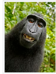
One of the monkey selfies at issue in the dispute